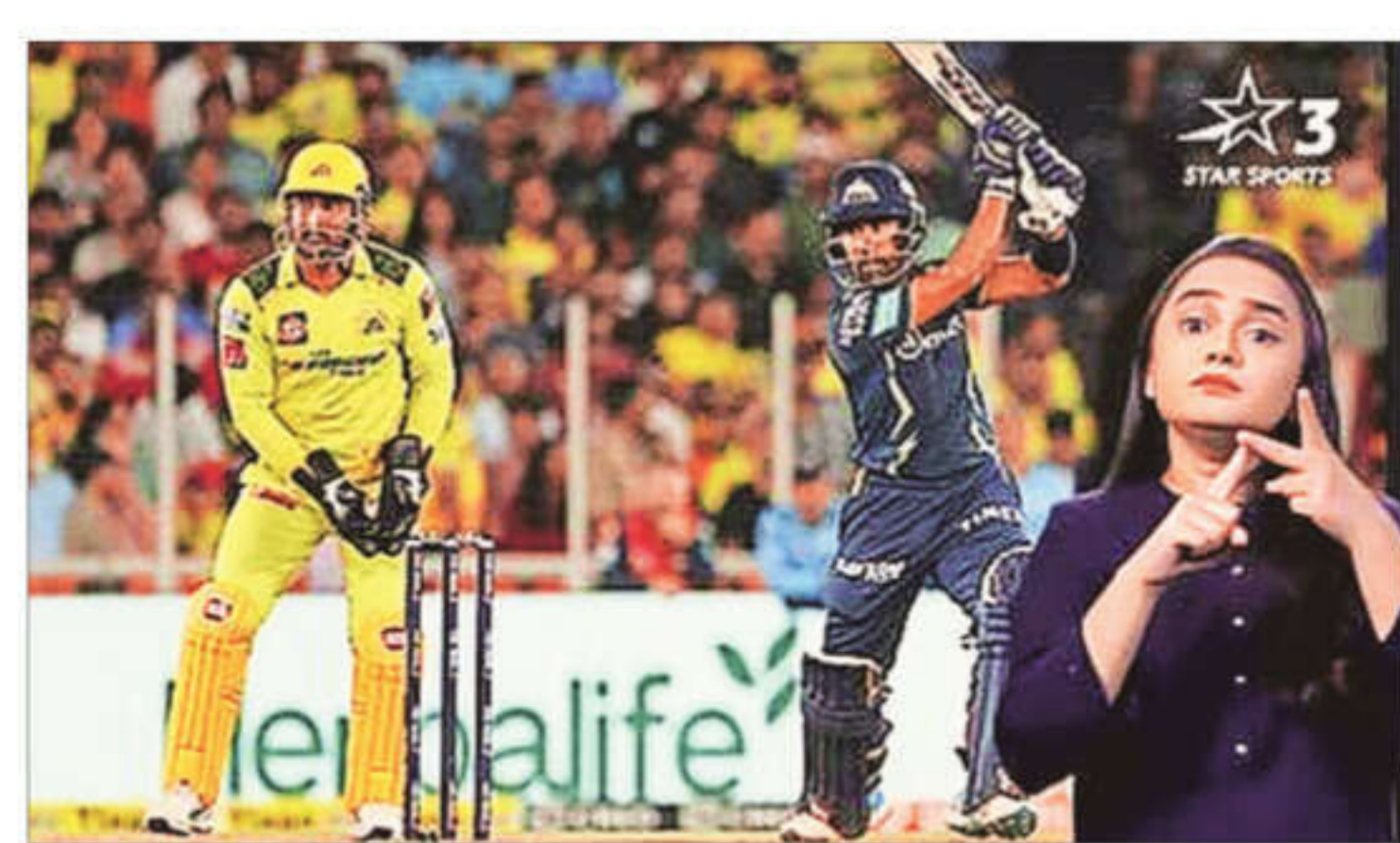
In a first for live sports broadcasting, Star Sports has added sign language interpretation to its IPL feed