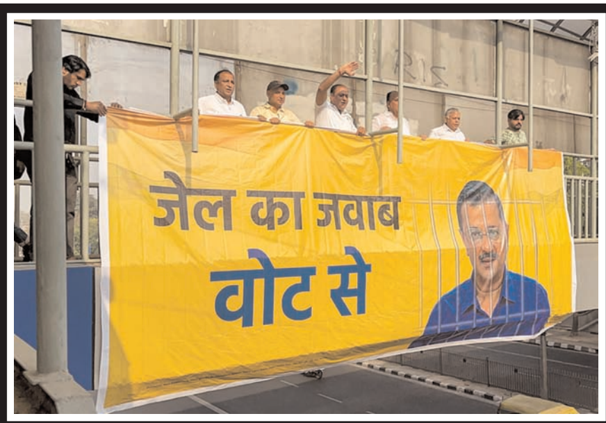
Aam Aadmi Party (AAP) supporters put up a poster in support of AAP supremo and Delhi Chief Minister Arvind Kejriwal who is in judicial custody till April 15 in connection with a money-laundering case linked to the alleged Delhi excise policy scam, at ITO, in New Delhi.